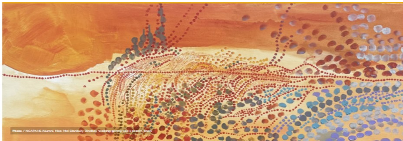
Photo / NCAPAHG Alumni, Mee-Mai Gorbury Director 'wicking green' 200 x 300cm, 2017