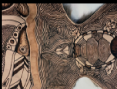
Cawabuwun Gunnigal 2025, pyrography on kangaroo pelt (detail)

Please join us as we raise the Aboriginal and Torres Strait Islander flags for NAIDOC Week.